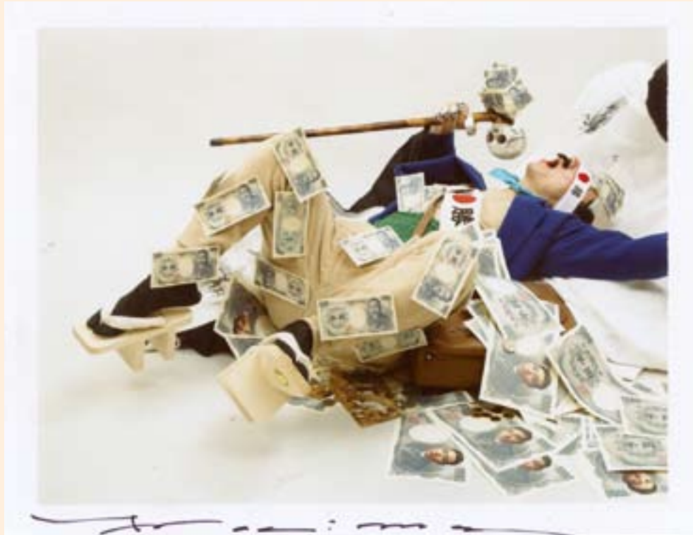
| Swamped by Bills - 1991 - Instant Colour Film 10 x 13 cm