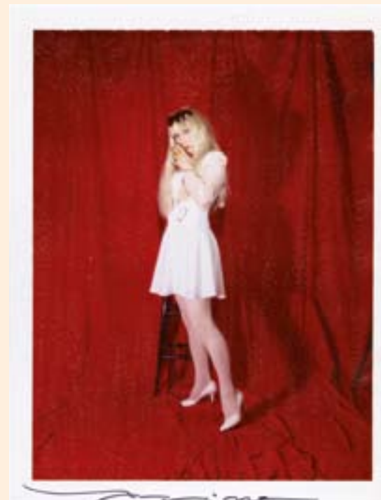
| M in a White Dress - 1997 - Instant Colour Film 13 x 10 cm