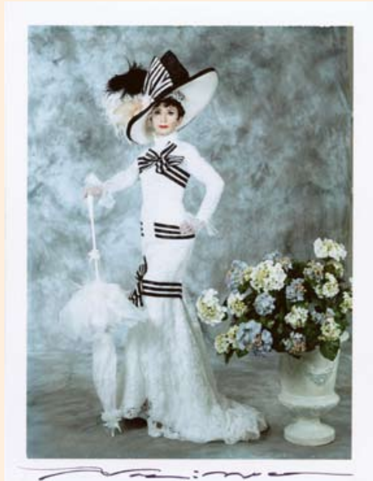
Audrey Hepburn 2