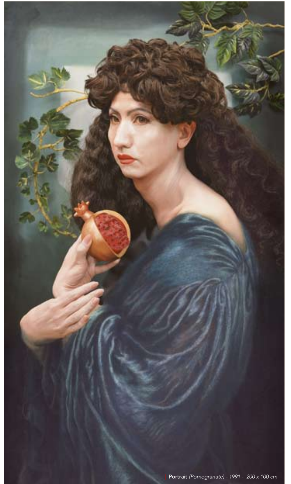
| Portrait (Pomegranate) - 1991 - 200 x 100 cm