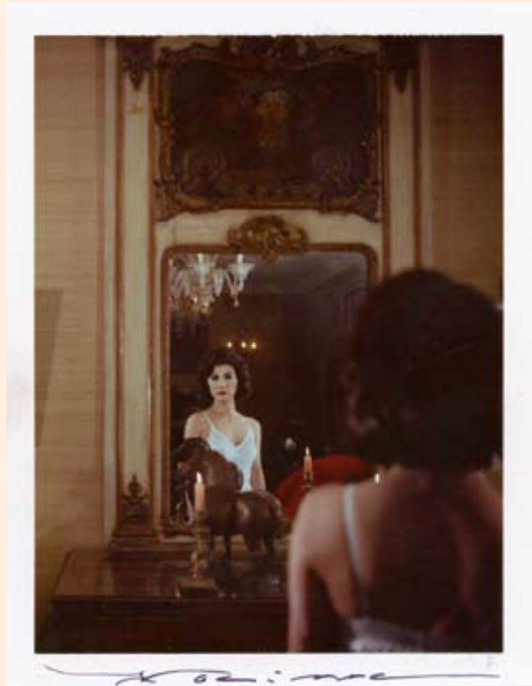
| Elizabeth Taylor 3 - 1995 - Instant Colour Film 13 x 10 cm