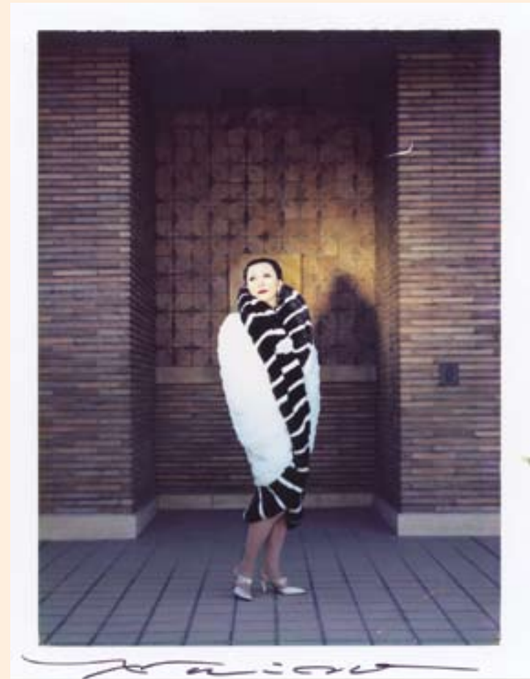
| Greta Garbo 1 - 1995 - Instant Colour Film 13 x 10 cm