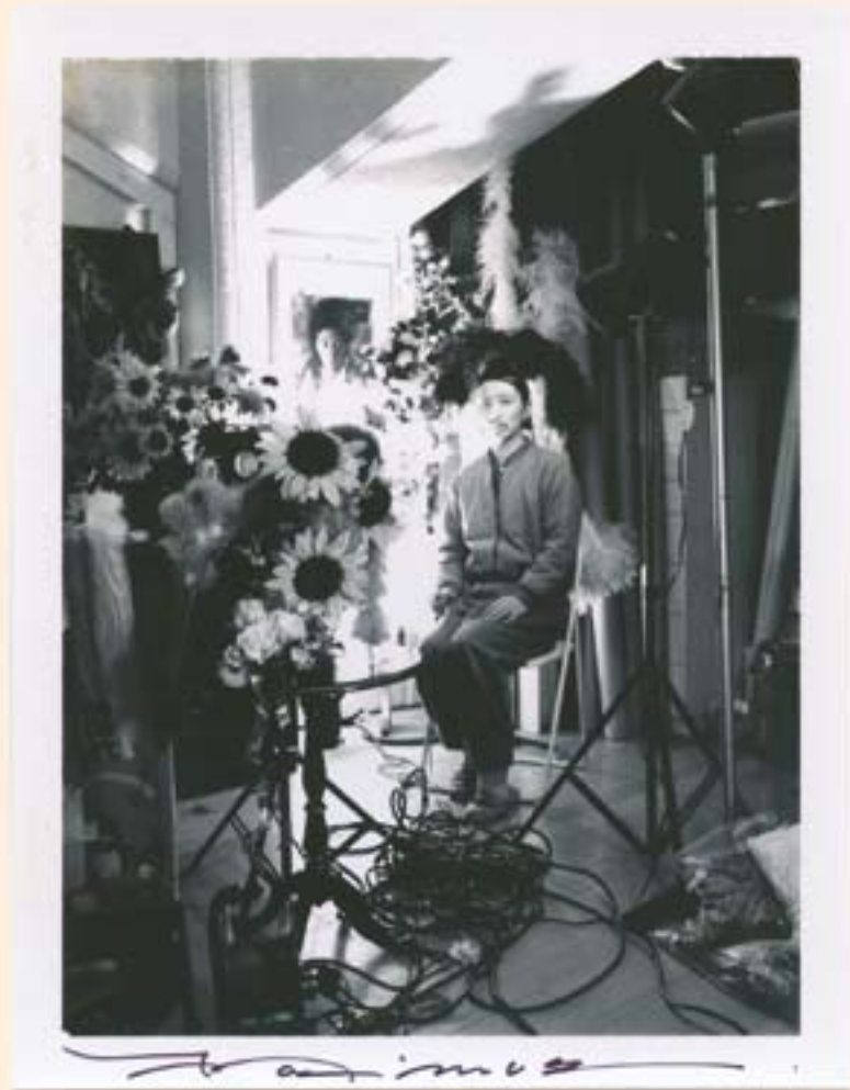
| Prologue (Just Before Sleep) - 1997 - Instant Black and White Film 13 x 10 cm