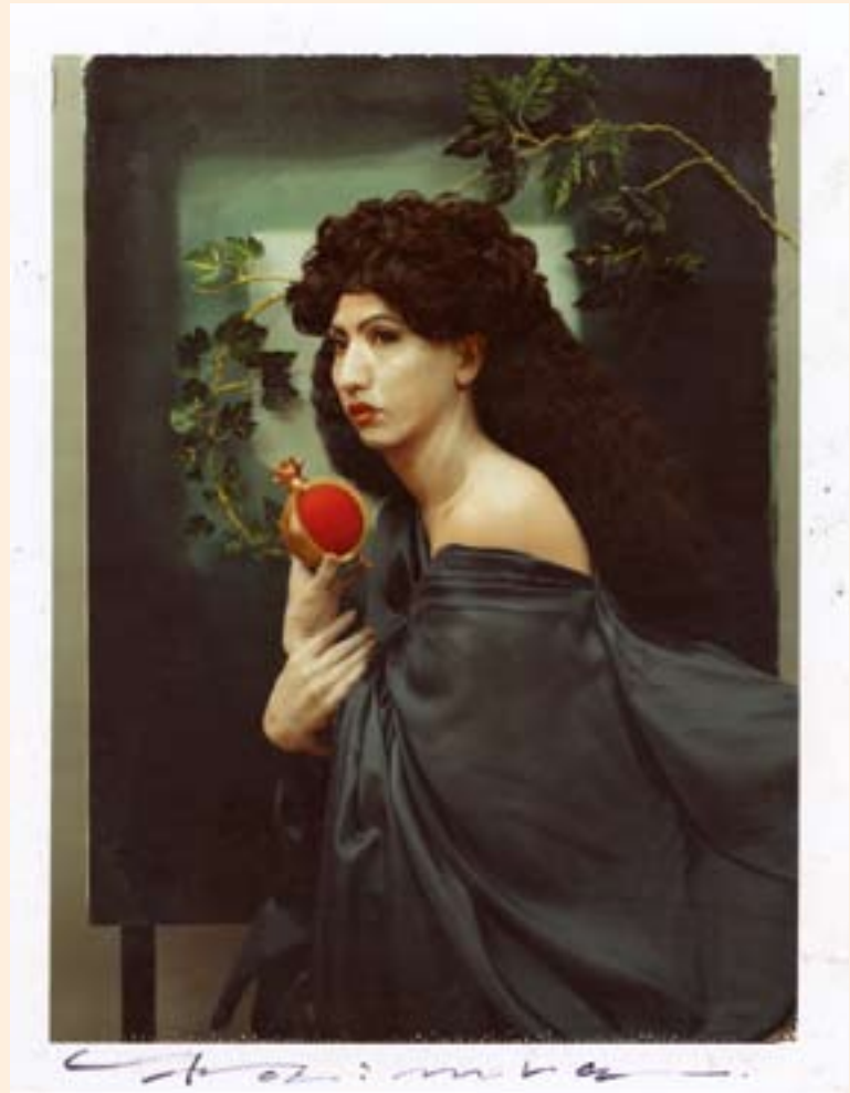
| Day of Eating a Pomegranate - 1991 - Instant Colour Film 13 x 10 cm