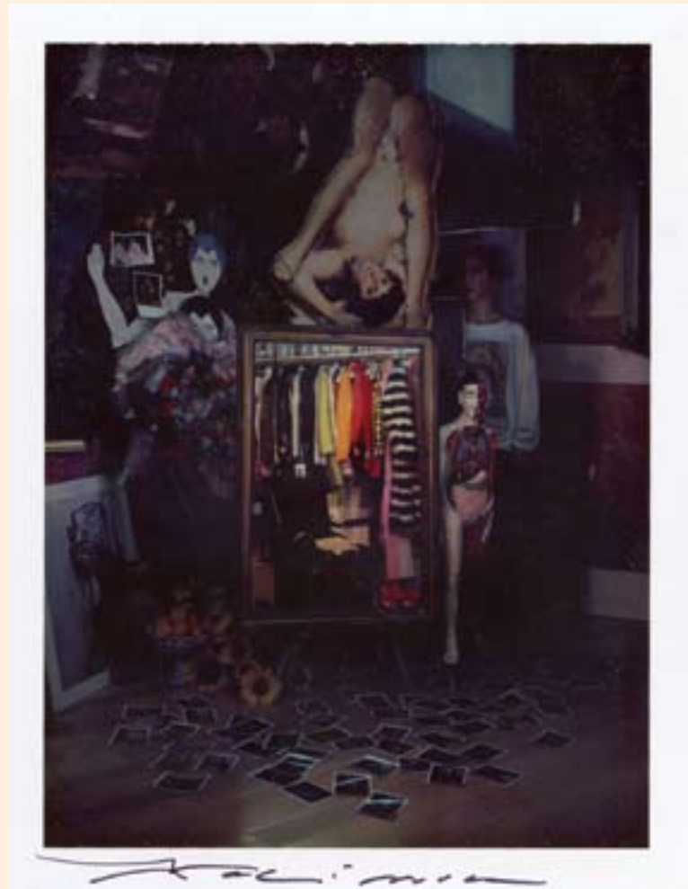
| Mona Lisa Through the Looking-Glass 2