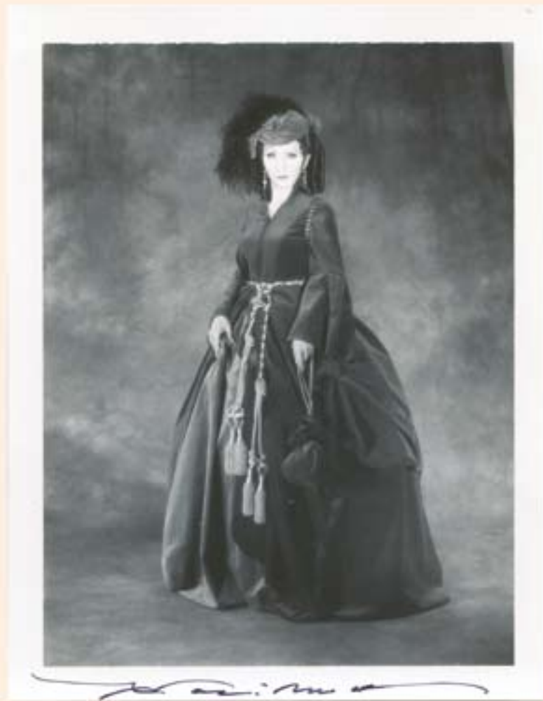
| Vivien Leigh ( Gone With The Wind ) - 1995 - Instant Black and White Film 13 x 10 cm