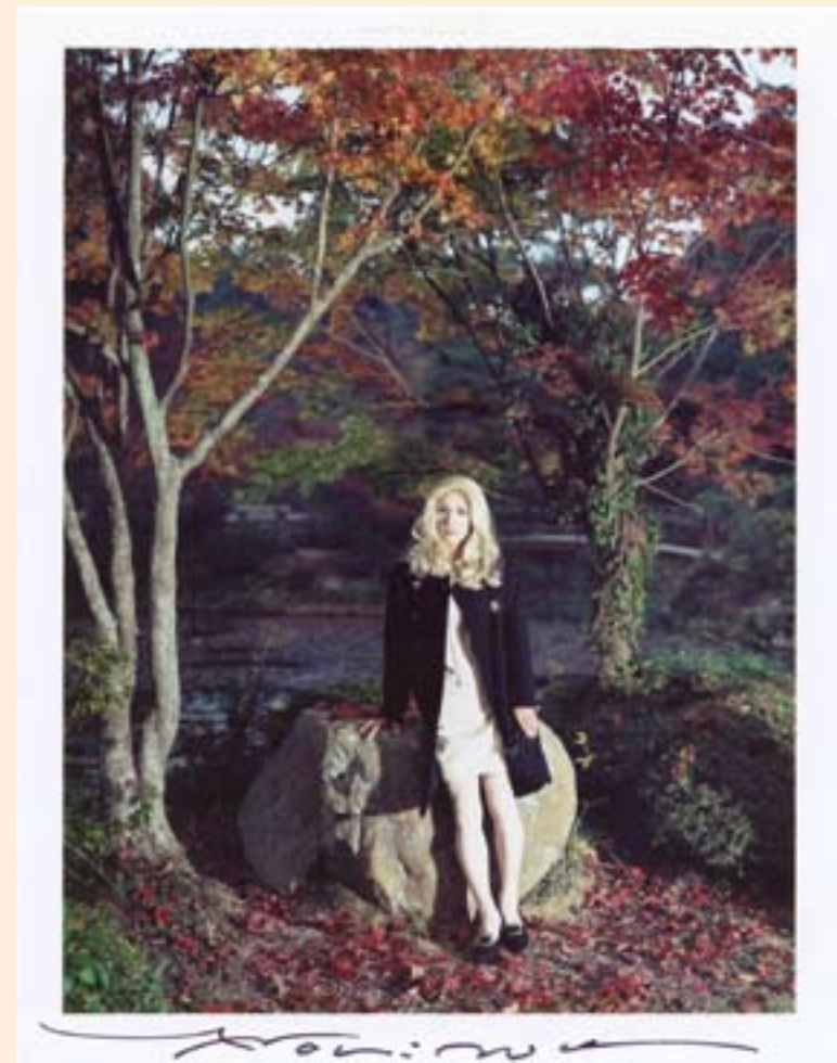
| Catherine Deneuve 2 ( Belle de Jour ) - 1995 - Instant Colour Film 13 x 10 cm