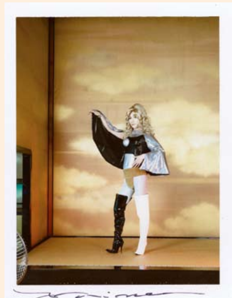
| Jane Fonda 4 (Barbarella) - 1995 - Instant Colour Film 13 x 10 cm