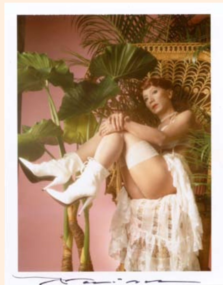
| Silvia Kristel 2 (Emmanuelle) - 1995 - Instant Colour Film 13 x 10 cm