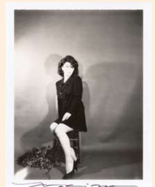
> | M in Black Suits 1 - 4 - 1997 - Instant Black and White Film 13 x 10 cm