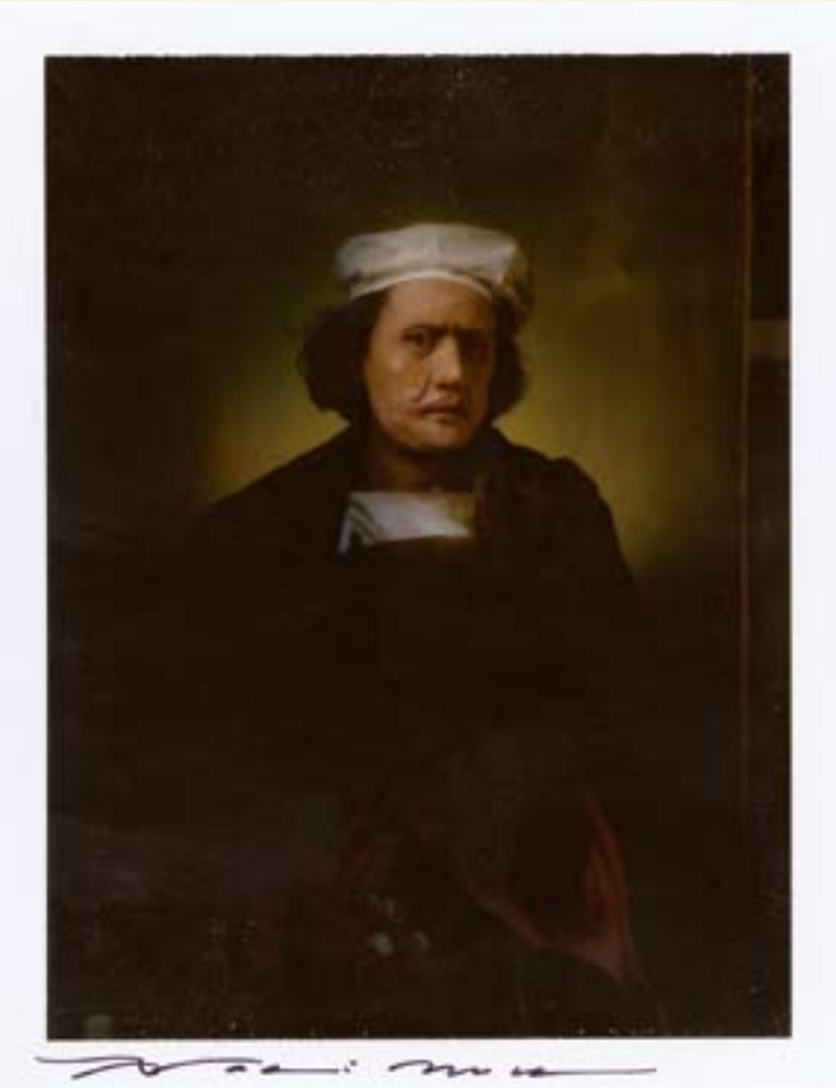
| Unfinished Self-Portrait - 1994 - Instant Colour Film 13 x 10 cm