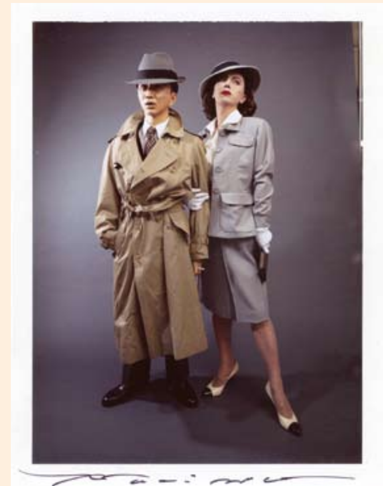
| Ingrid Bergman 2 (Casablanca) - 1995 - Instant Colour Film 13 x 10 cm