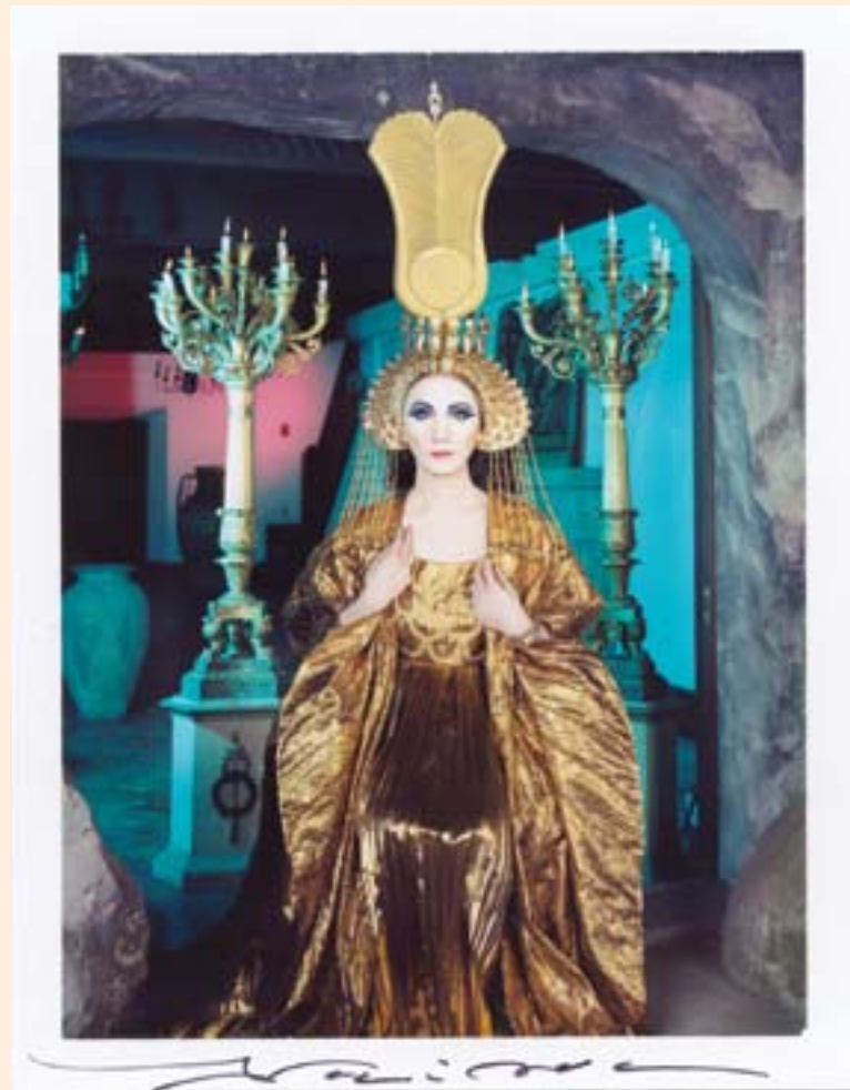
|Elizabeth Taylor 1