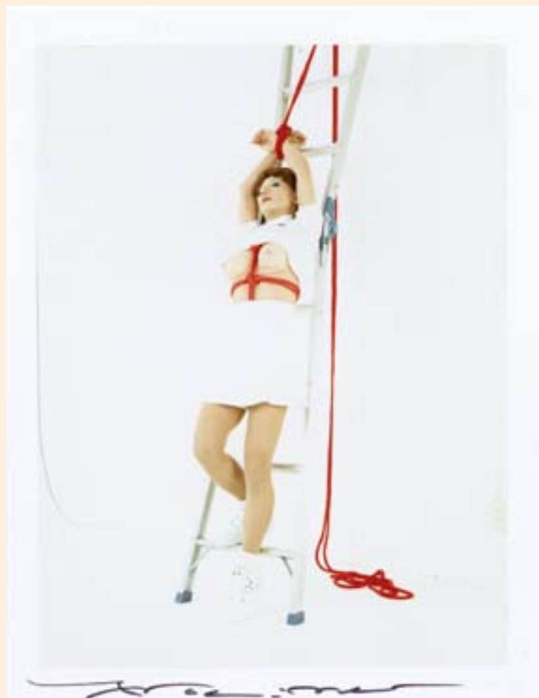
| Silvia Kristel 3 (Emmanuelle) - 1995 - Instant Colour Film 13 x 10 cm