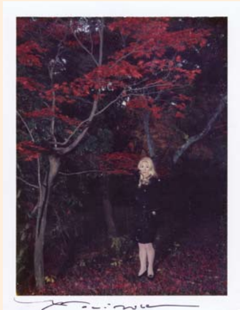
| Catherine Deneuve 1 ( Belle de Jour ) - 1995 - Instant Colour Film 13 x 10 cm