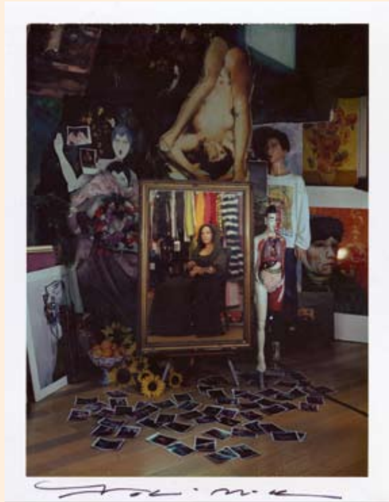
| Mona Lisa Through the Looking-Glass 4 - 1998 - Instant Colour Film 13 x 10 cm