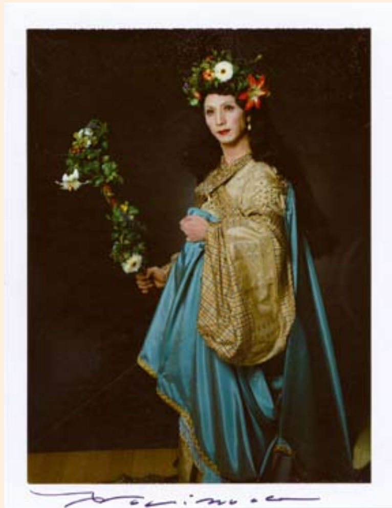
| Wife - 1994 - Instant Colour Film 13 x 10 cm