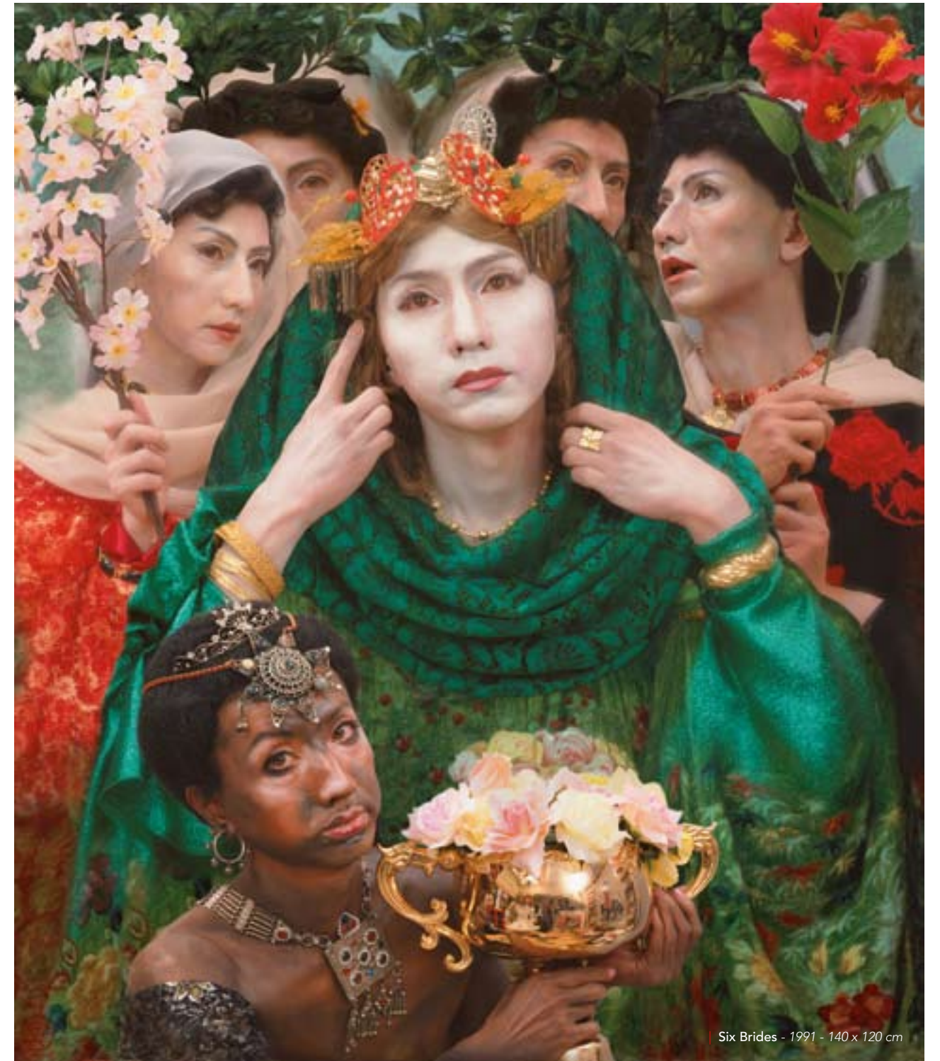
Six Brides - 1991 - 140 x 120 cm