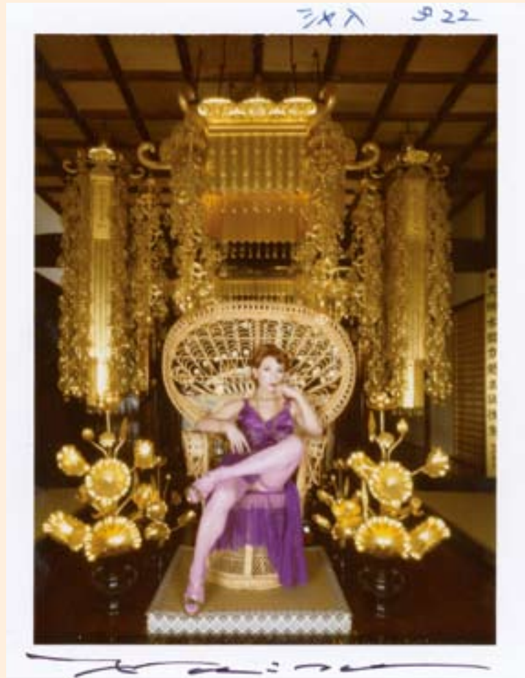
| Silvia Kristel 5 (