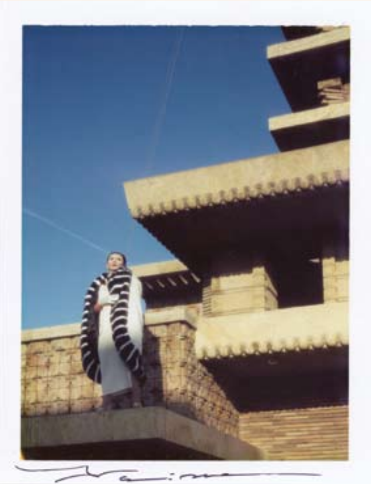
| Greta Garbo 4 - 1995 - Instant Colour Film 13 x 10 cm