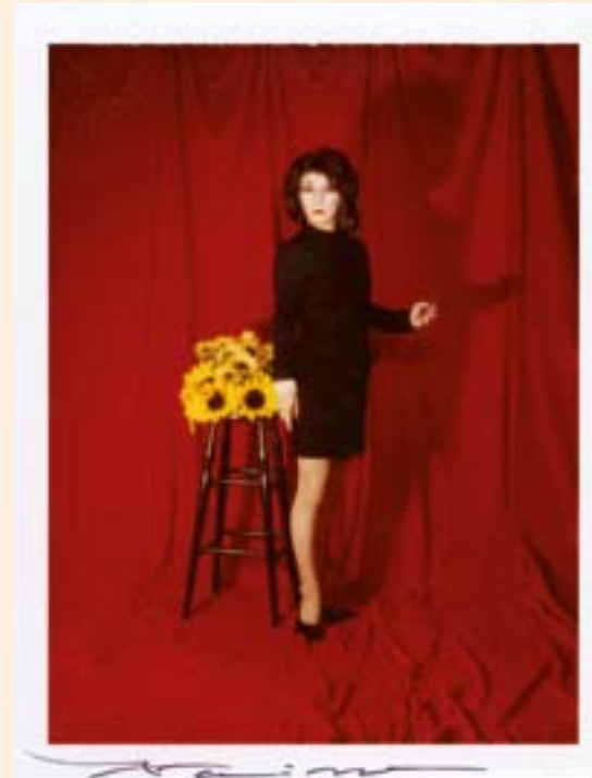
| M and Sunflower - 1997 - Instant Colour Film 13 x 10 cm