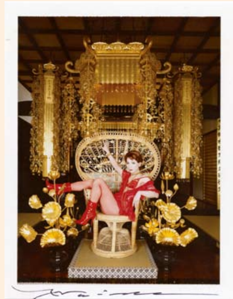
| Silvia Kristel 6 (Emmanuelle) - 1995 - Instant Colour Film 13 x 10 cm