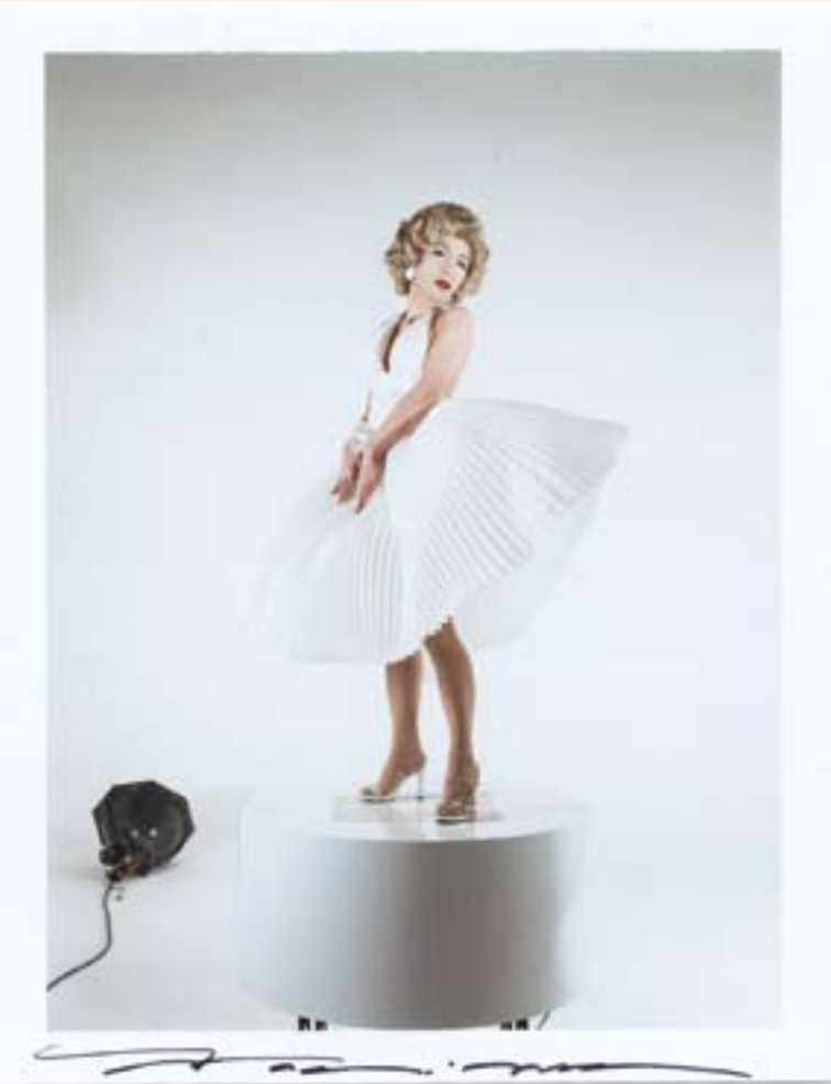
| White Marilyn