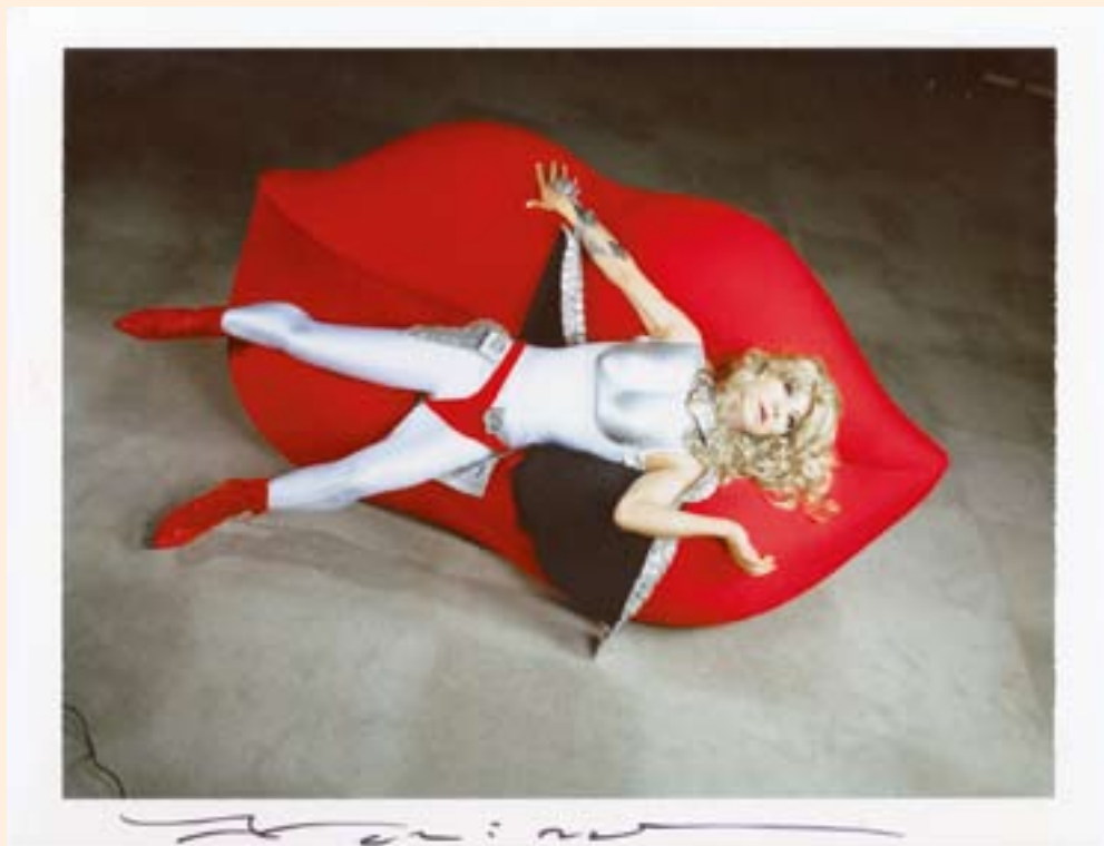
| Jane Fonda 1 (Barbarella) - 1995 - Instant Colour Film 10 x 13 cm