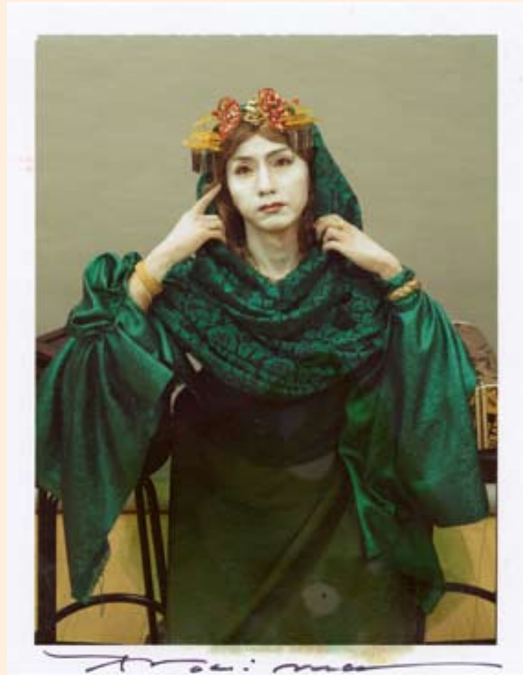
| Six Brides (Wearing a Headdress) - 1991 - Instant Colour Film 13 x 10 cm