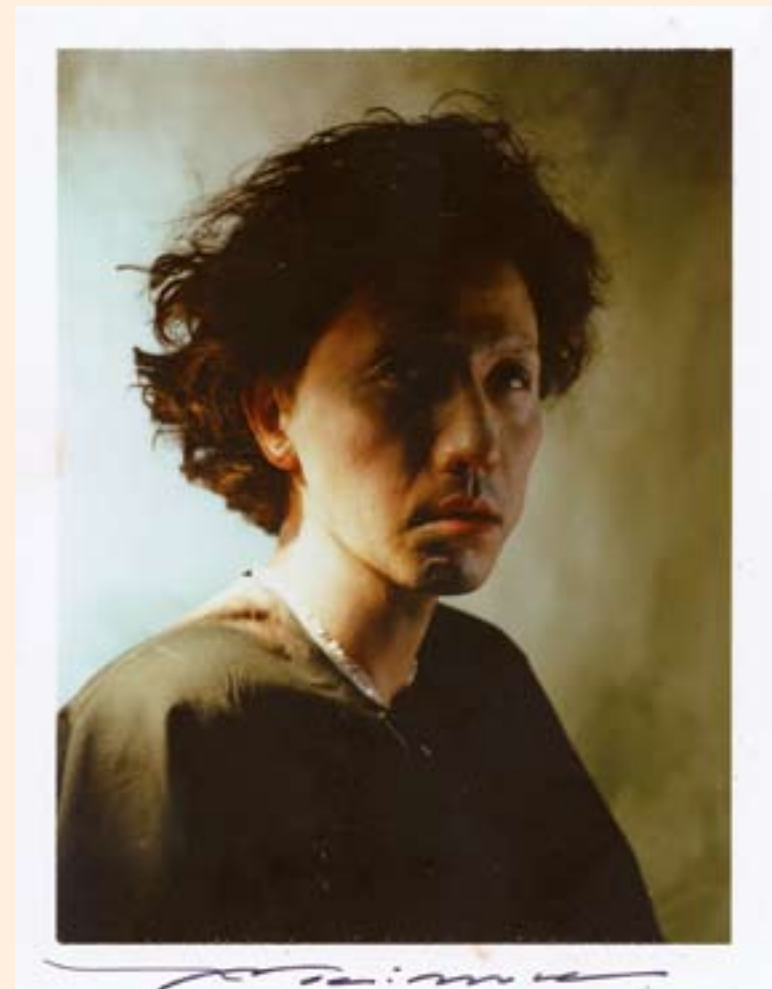
| Young Self-Portrait 2 - 1994 - Instant Colour Film 13 x 10 cm