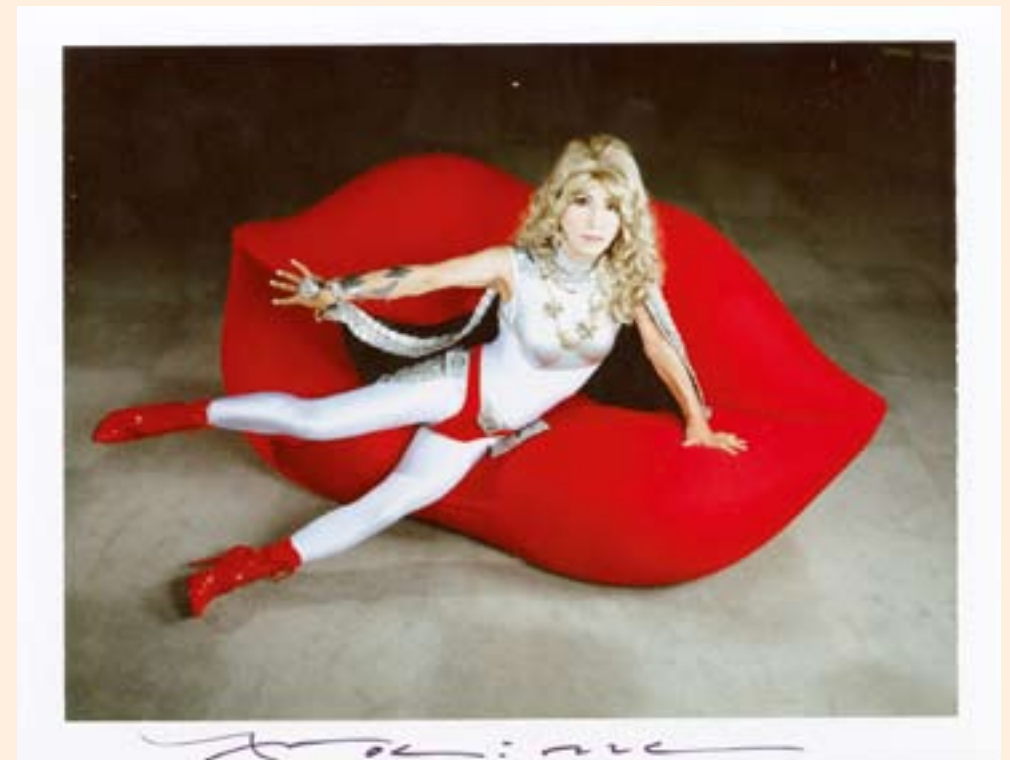
| Jane Fonda 2 (Barbarella) - 1995 - Instant Colour Film 10 x 13 cm