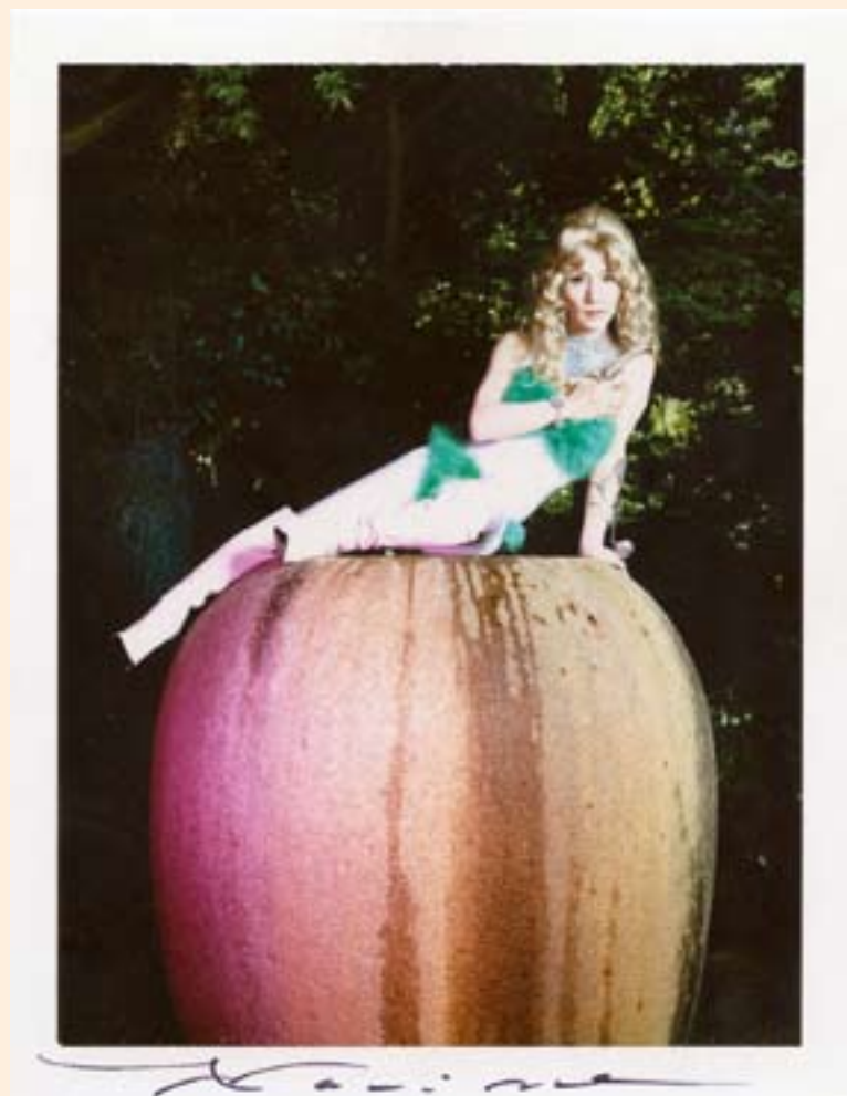
| Jane Fonda 3 (Barbarella) - 1995 - Instant Colour Film 13 x 10 cm