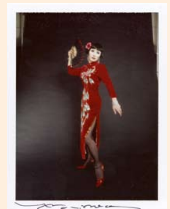
| M in a China Dress - 1997 - Instant Colour Film 13 x 10 cm