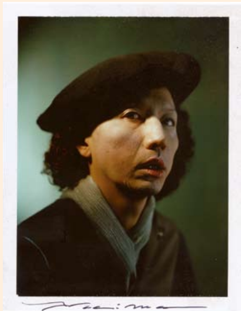
| Young Self-Portrait 1 - 1994 - Instant Colour Film 13 x 10 cm