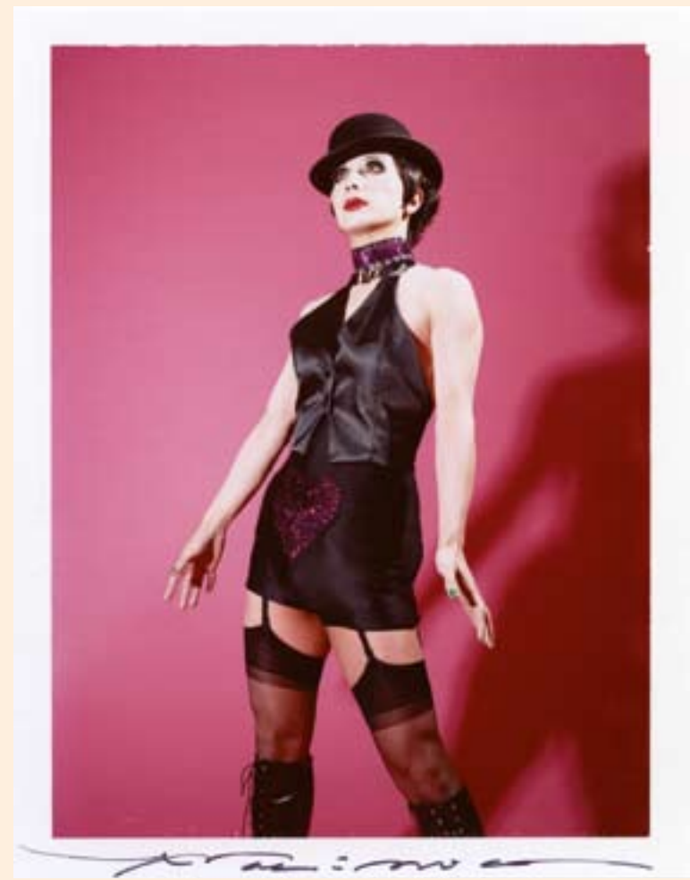
| Liza Minelli (Cabaret) - 1995 - Instant Colour Film 13 x 10 cm