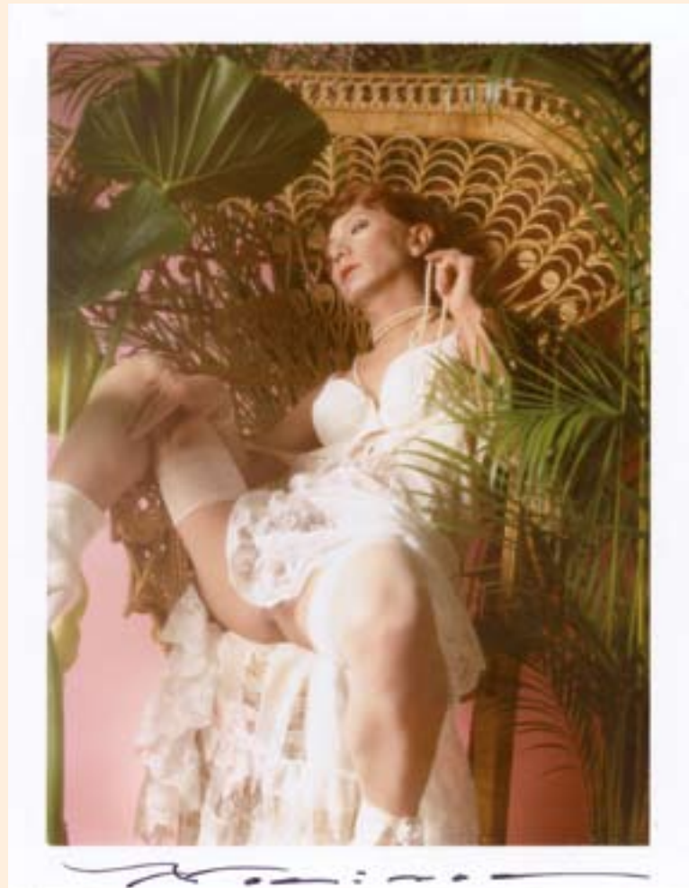
| Silvia Kristel 1 (Emmanuelle) - 1995 - Instant Colour Film 13 x 10 cm