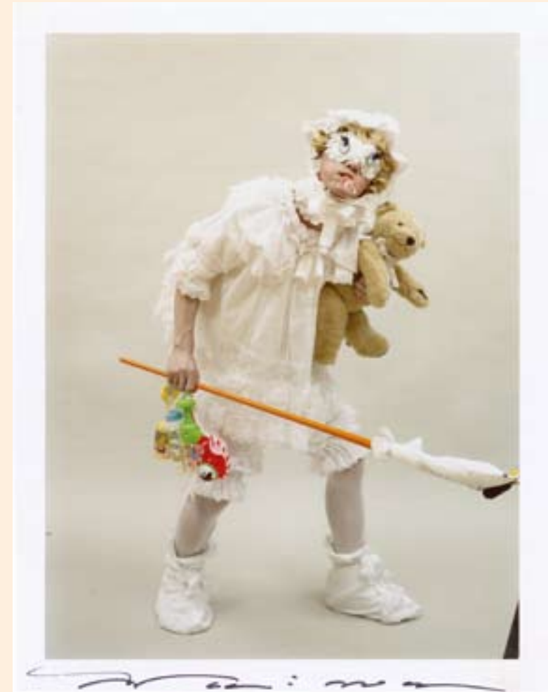
| Wherabouts of a Child - 1991 - Instant Colour Film 13 x 10 cm