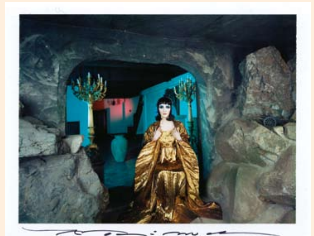
|Elizabeth Taylor 2 (Cleopatra) - 1995 - Instant Colour Film 10 x 13 cm