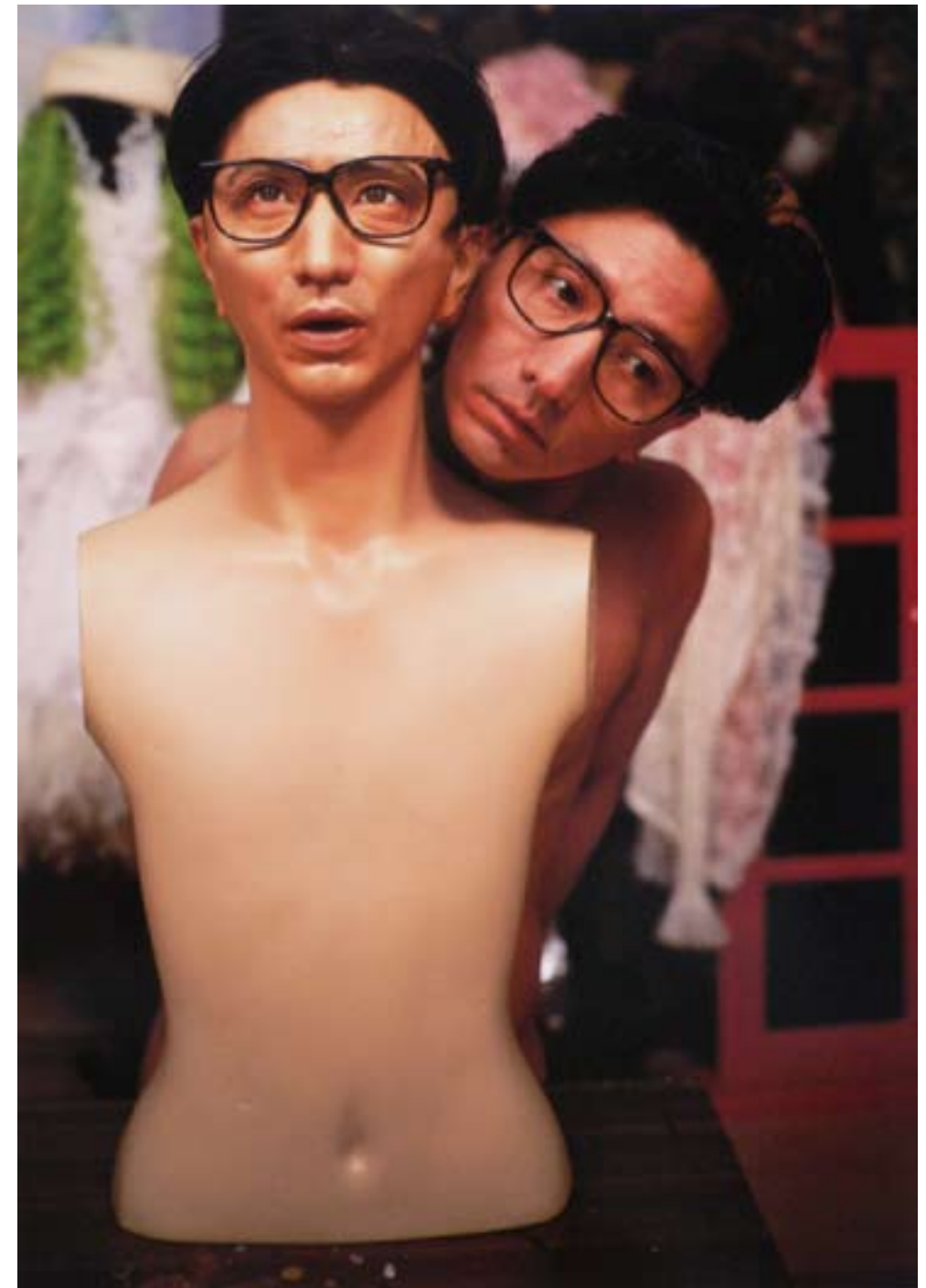
| On Self-Portrait - 2007 - 25 x 20 cm