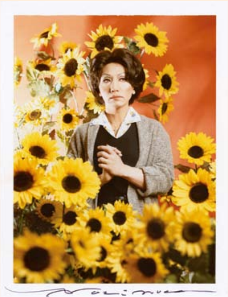
| Sophia Loren