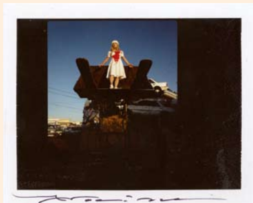
| Faye Dunaway 3 (Bonny and Clyde) - 1995 - Instant Colour Film 8,6 x 10,6 cm