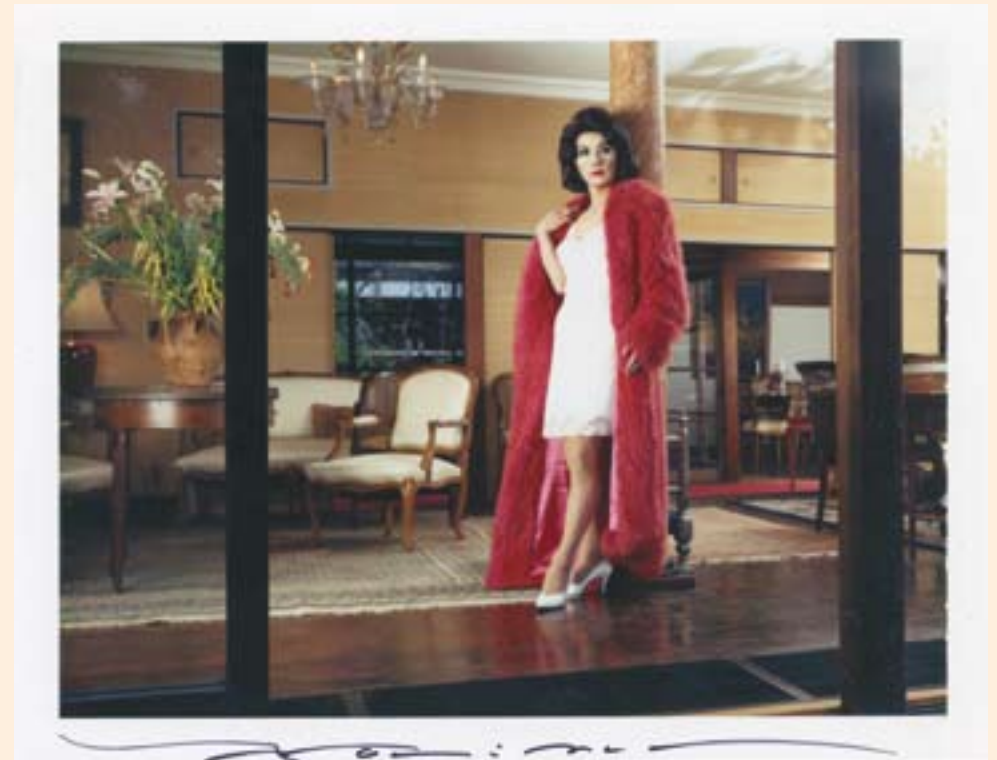
| Elizabeth Taylor 4 - 1995 - Instant Colour Film 10 x 13 cm