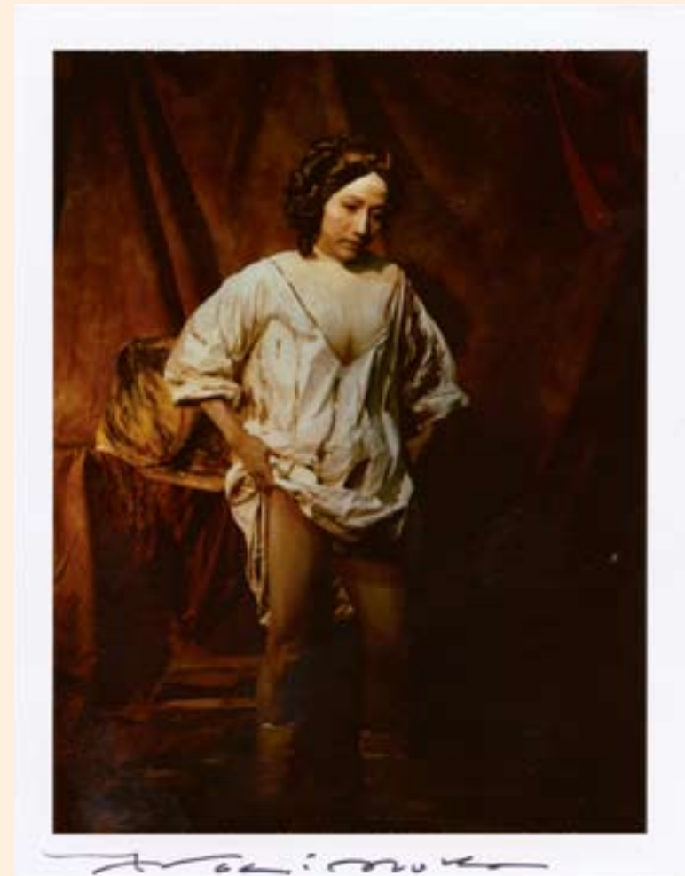
| Lover - 1994 - Instant Colour Film 13 x 10 cm