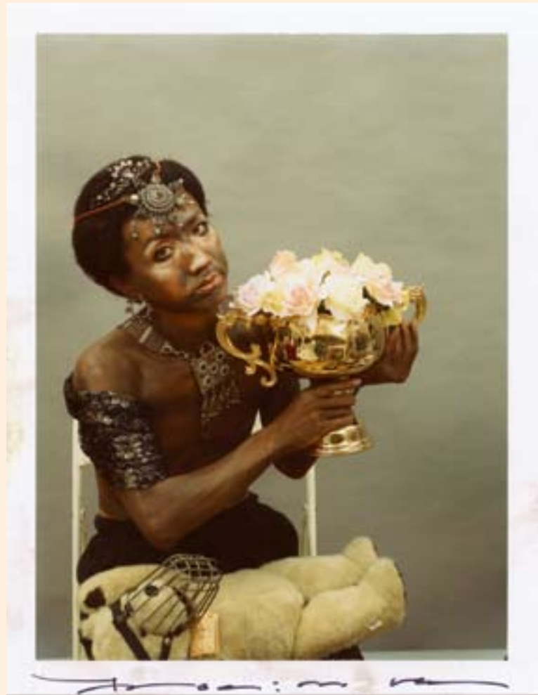
| Six Brides ( Holding a Goblet ) - 1991 - Instant Colour Film 13 x 10 cm