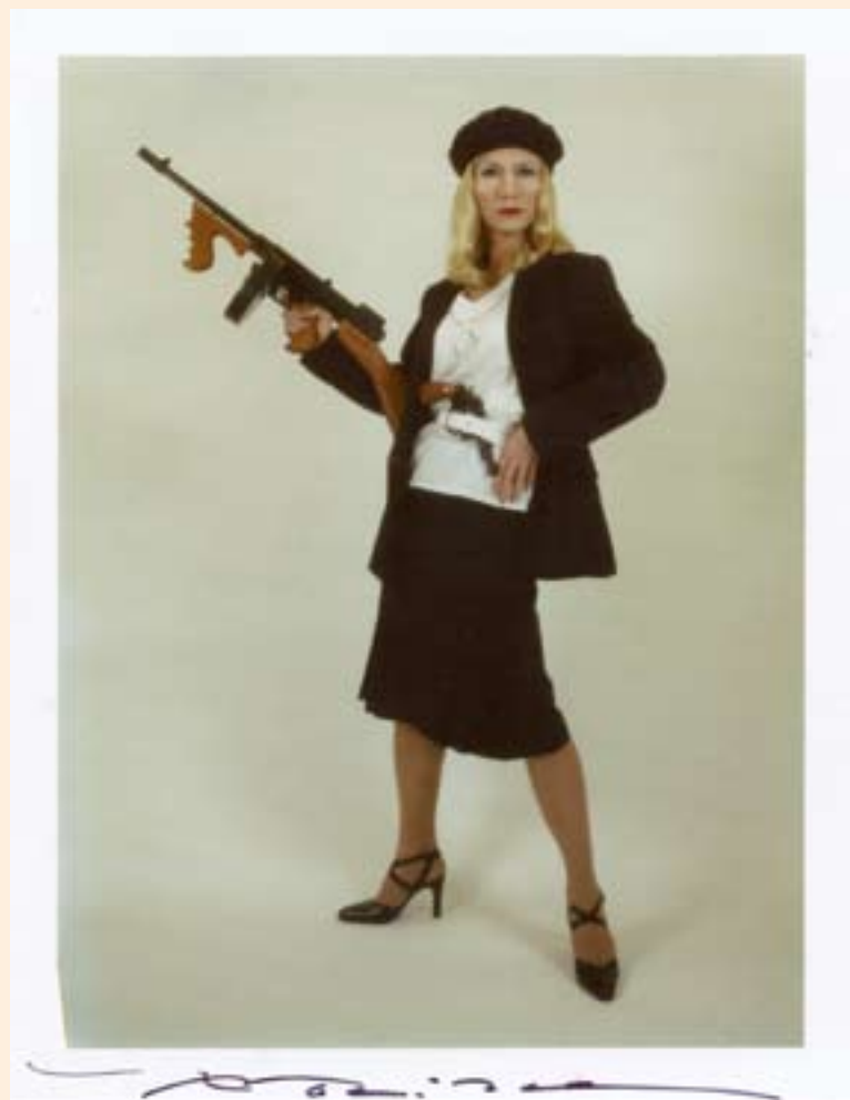
| Faye Dunaway 1 ( Bonnie and Clyde ) - 1995 - Instant Colour Film 13 x 10 cm