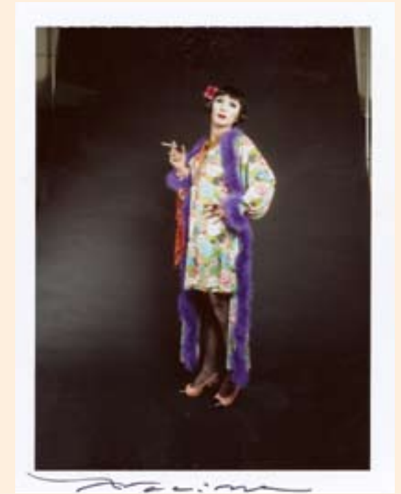
| M Holding a Cigarette - 1997 - Instant Colour Film 13 x 10 cm