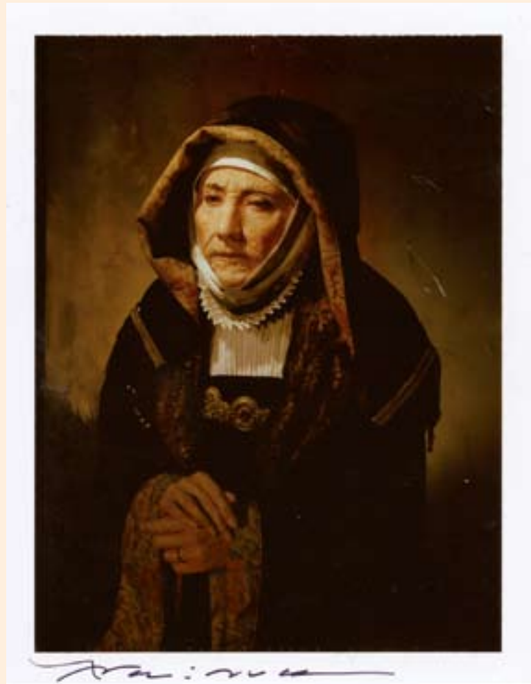
| Mother - 1994 - Instant Colour Film 13 x 10 cm