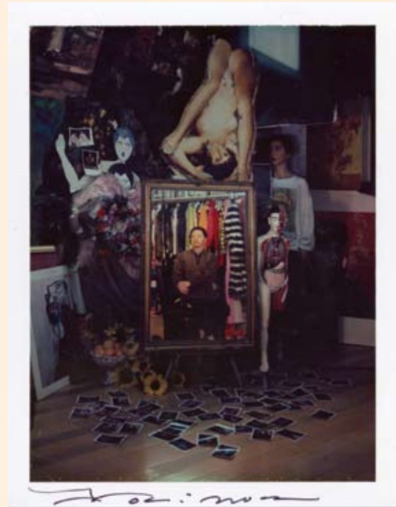
| Mona Lisa Through the Looking-Glass 3 - 1998 - Instant Colour Film 13 x 10 cm