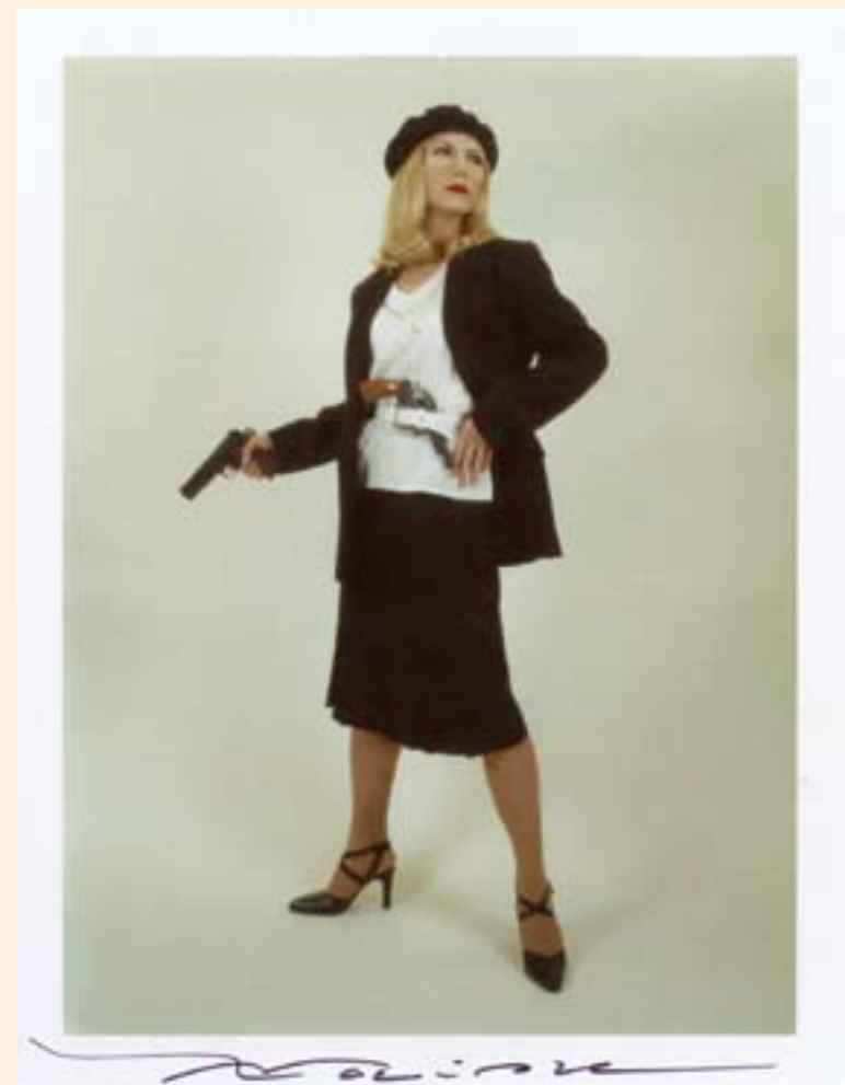
| Faye Dunaway 2 ( Bonnie and Clyde ) - 1995 - Instant Colour Film 13 x 10 cm