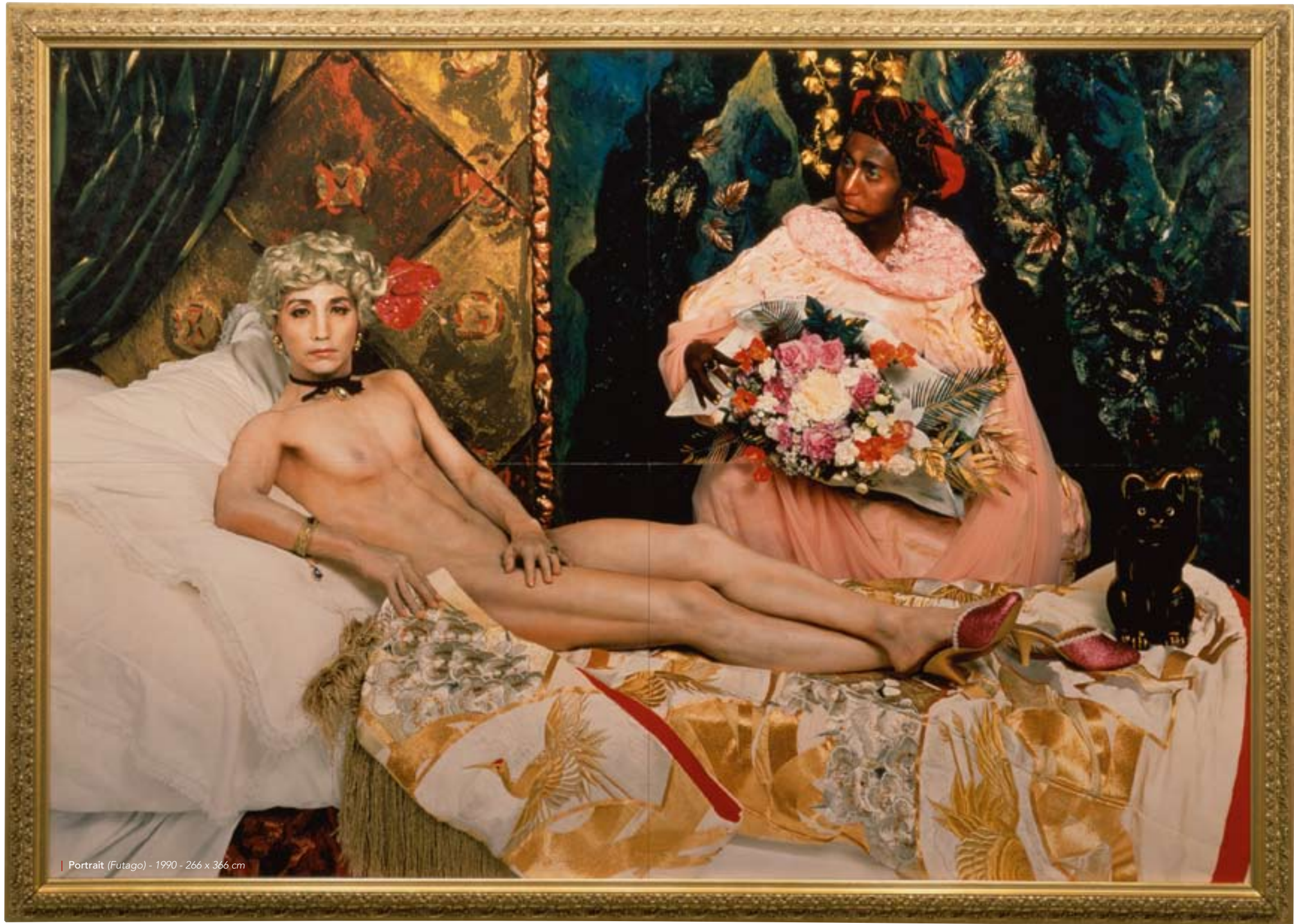
| Portrait (Futago) - 1990 - 266 x 366 cm