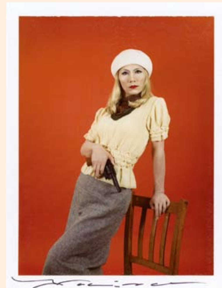
| Faye Dunaway 4 (Bonny and Clyde) - 1995 - Instant Colour Film 13 x 10 cm