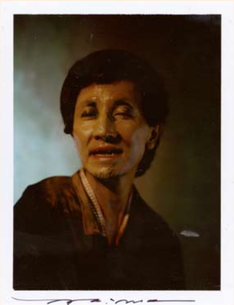
| Young Self-Portrait 3 - 1994 - Instant Colour Film 13 x 10 cm