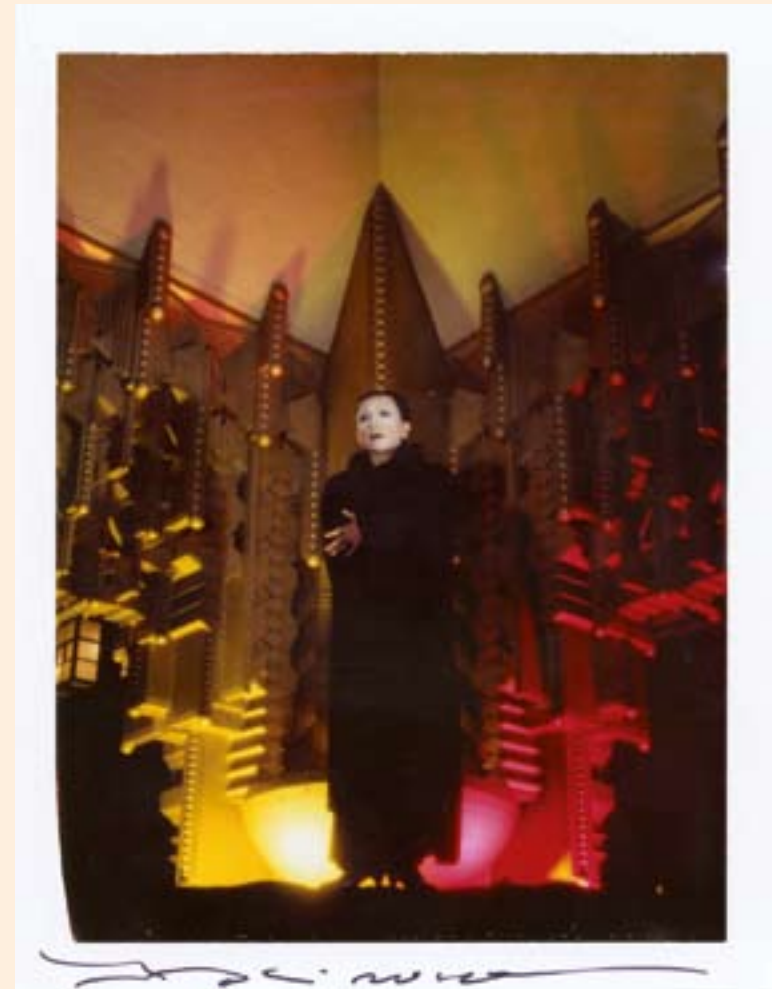
| Greta Garbo 3 - 1995 - Instant Colour Film 13 x 10 cm