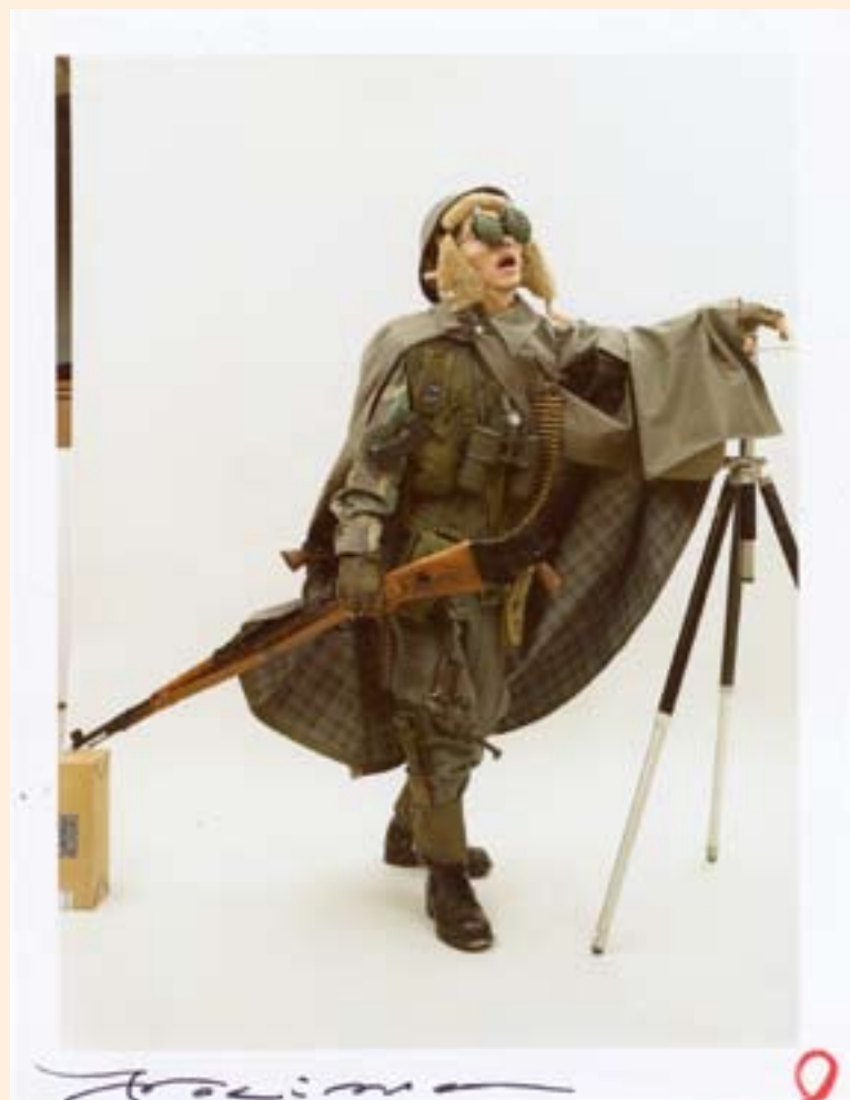
| Wherabouts of a Soldier - 1991 - Instant Colour Film 13 x 10 cm