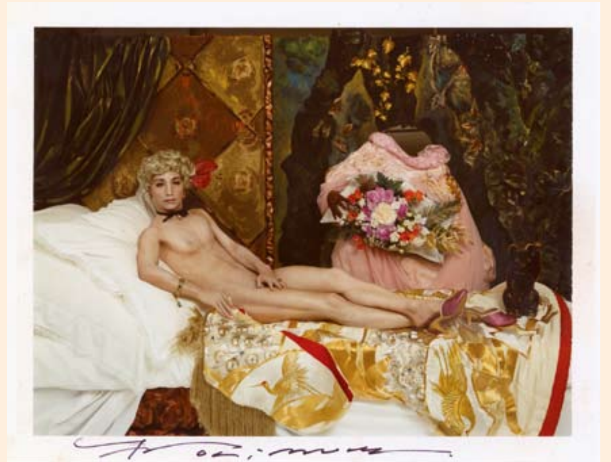
| Absence of a Servant - 1988 - Instant Colour Film 10 x 13 cm