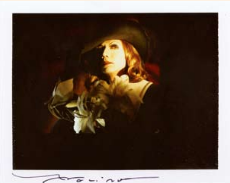
| Greta Garbo 5 - 1995 - Instant Colour Film 8,6 x 10,6 cm