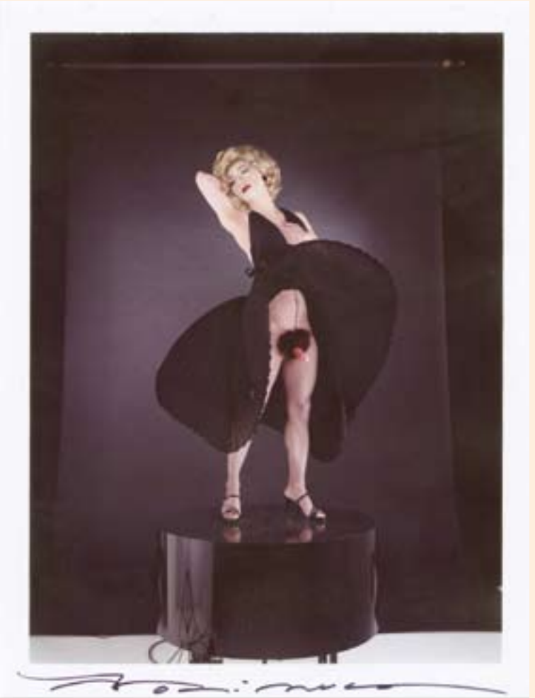
| Black Marilyn - 1995 - Instant Colour Film 13 x 10 cm