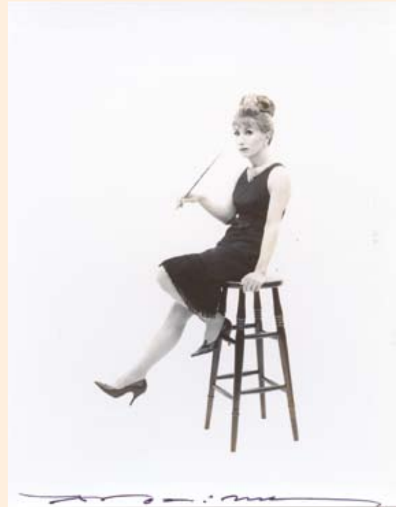
Audrey Hepburn 1 (Tiffany's) - 1995 - Instant Black and White Film 13 x 10 cm