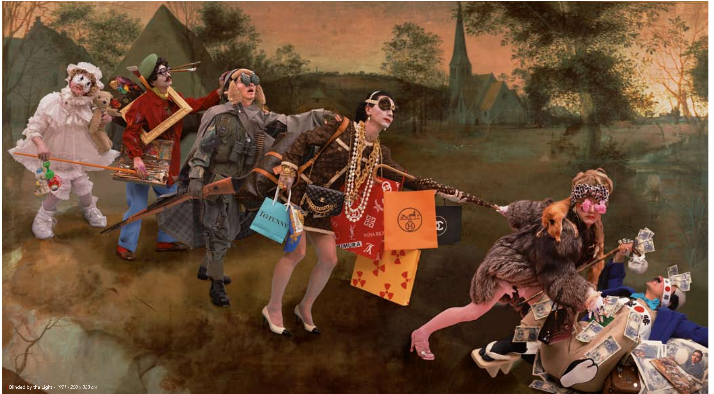
Blinded by the Light - 1991 - 200 x 363 cm