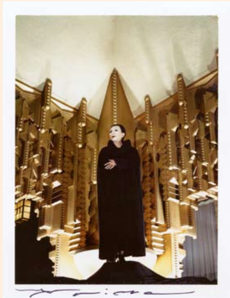
| Greta Garbo 2 - 1995 - Instant Colour Film 13 x 10 cm