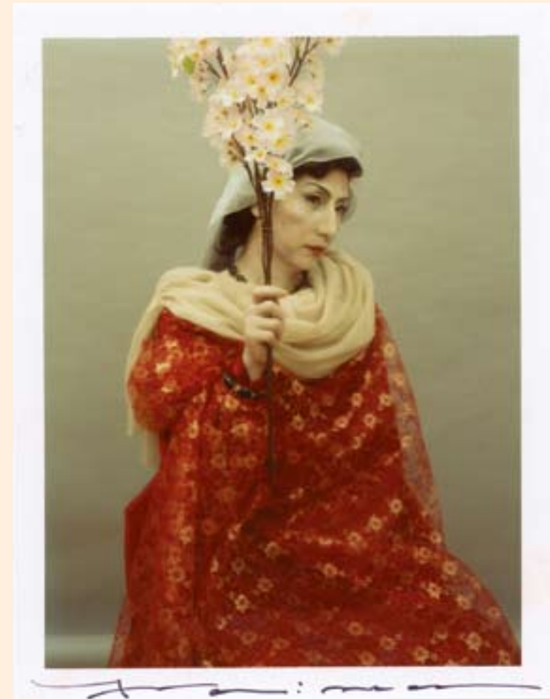
| Six Brides ( Holding a Cherry Blossom ) - 1991 - Instant Colour Film 13 x 10 cm