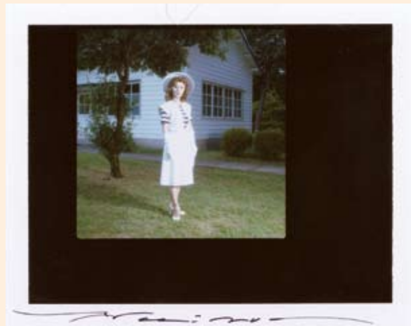
| Ingrid Bergman 1