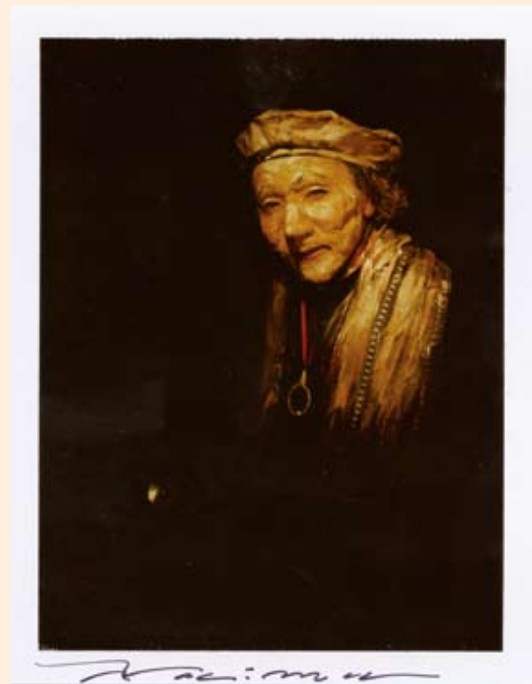
| Later Years - 1994 - Instant Colour Film 13 x 10 cm